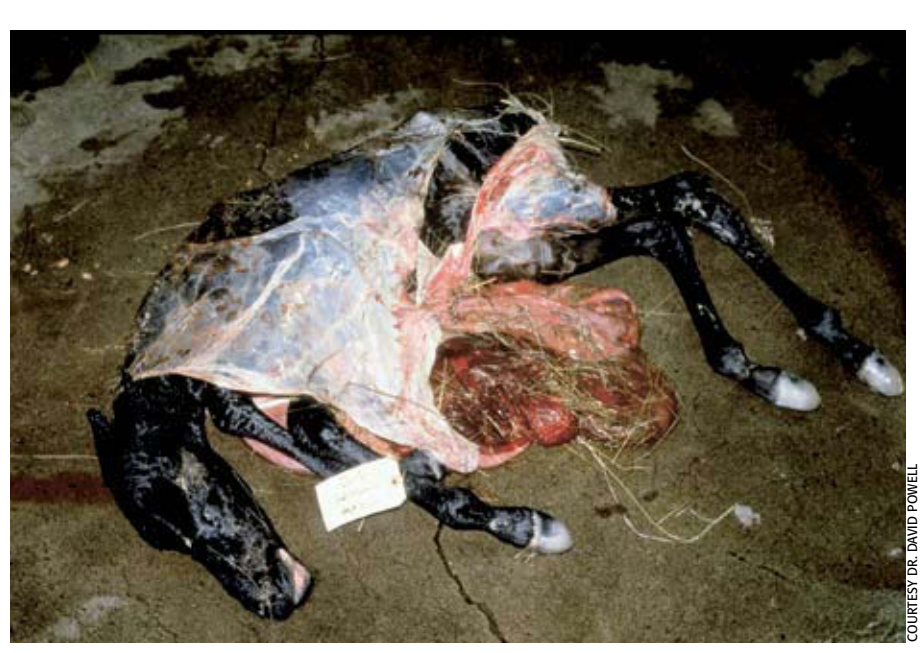
Direct contact with aborted fetus or placental tissue readily spreads infection due to the high concentration of virus within aborted tissues.

Once the infection moves to the lymph nodes in those first few days, it can reach a pregnant uterus or the central