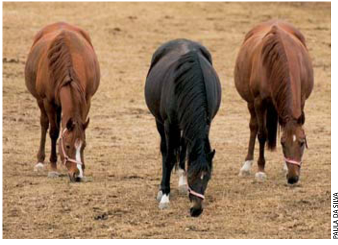
The recommended protocol for protecting pregnant mares against viral abortion is to administer herpesvirus vaccine prior to breeding, then at five, seven, and nine months of gestation.

Breathnach explains the process leading to abortion: "Farm owners and breeders often note that mares appeared 'perfectly normal' prior to aborting viruspositive fetuses. One of two things can have happened. Either the infecting virus successfully reached the draining lymph nodes despite only causing an inapparent subclinical infection and established sufficient viremia for abortion (or neurologic disease) to occur, or the mare was latently due to viral pneumonia. infected with the virus, which became reactivated through stress, and the abortive (following the commencement of wide-